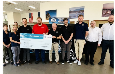
Spitzer Subaru Check Presentation