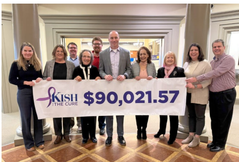
2024 Kish For The Cure Total Raised