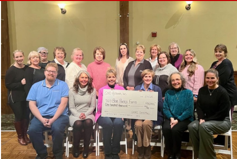
Girls Night Out Check Presentation