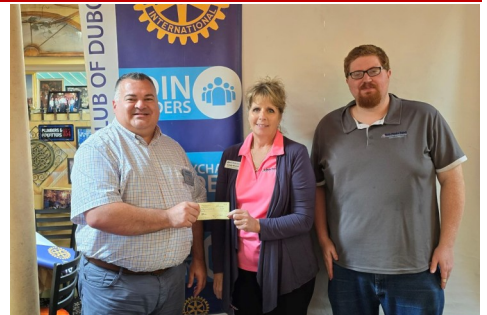
Rotary of DuBois