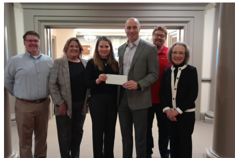
Kish For the Cure Check Presentation