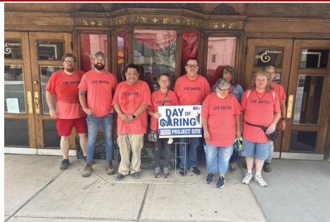
Mifflin Juniata Day of Caring